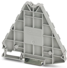
Spacer plate, width: 8.3 mm, height: 100 mm, color: gray

Please be informed that the data shown in this PDF document is generated from our online catalog. Please find the complete data in the user documentation. Our general terms of use for downloads are valid.